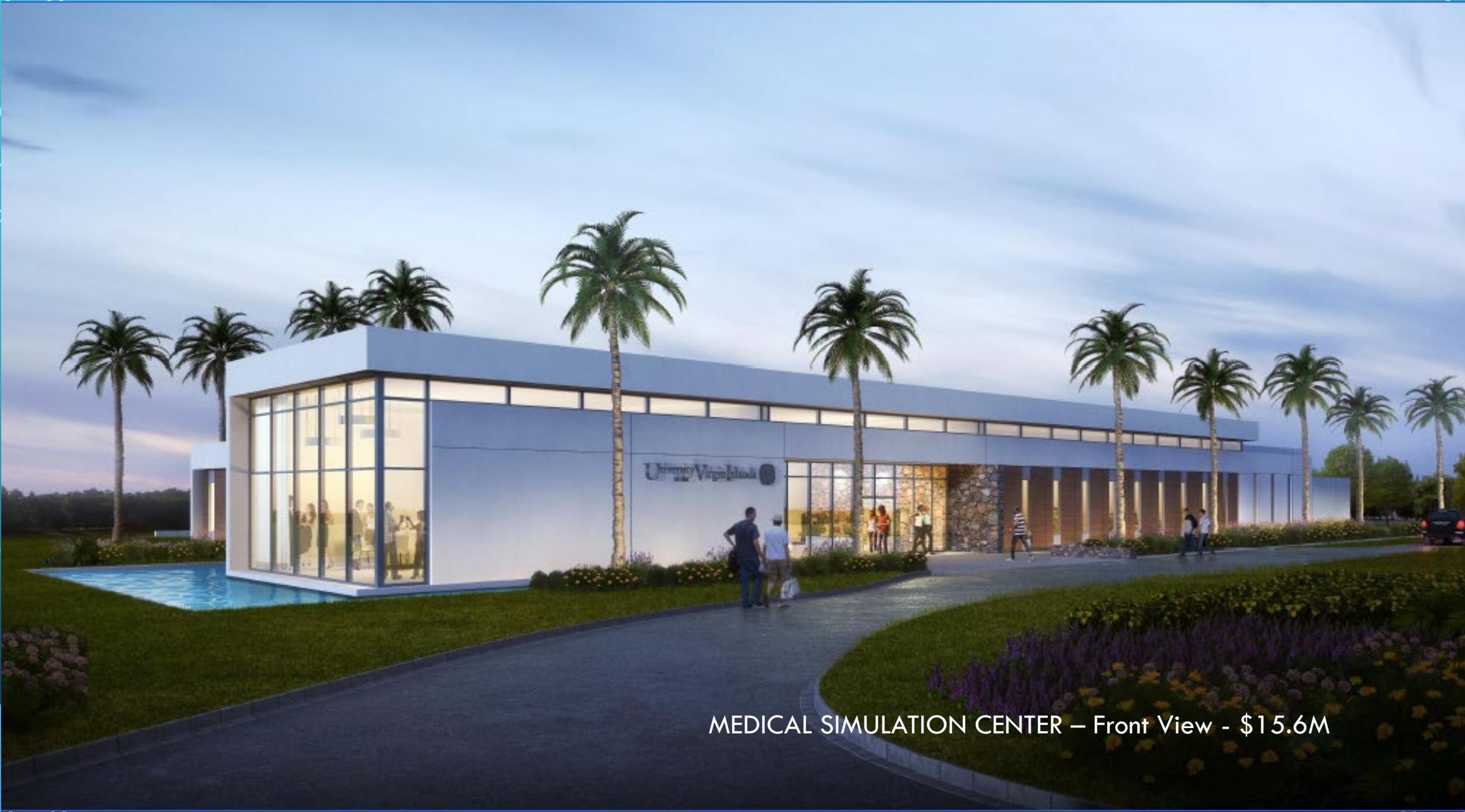
MEDICAL SIMULATION CENTER – Front View - $15.6M