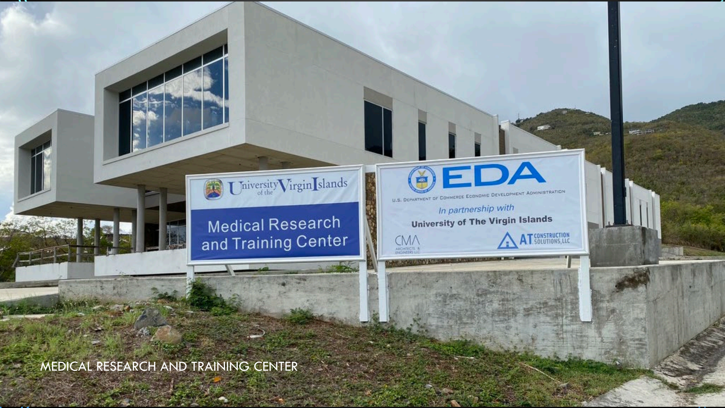
MEDICAL RESEARCH AND TRAINING CENTER