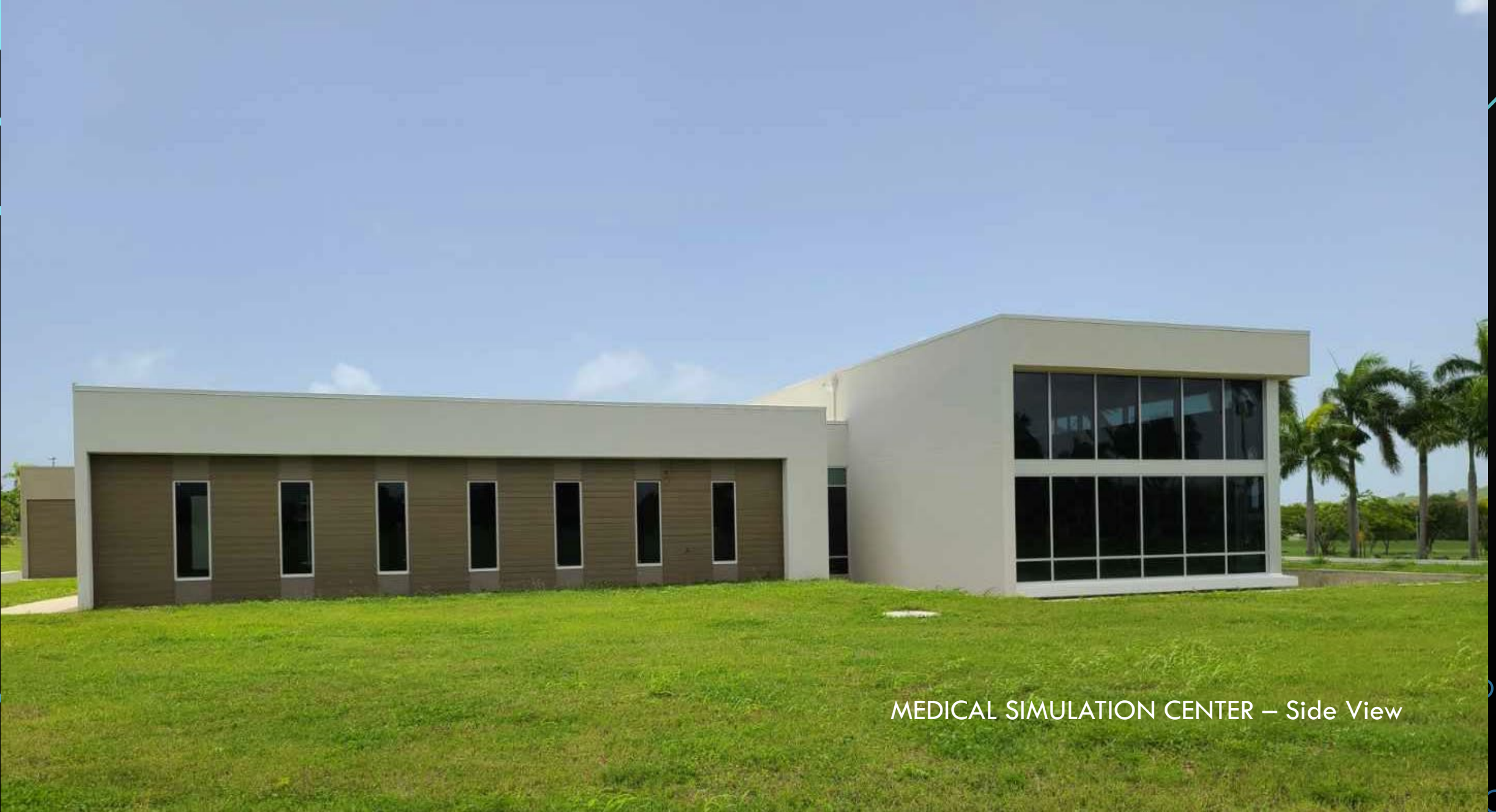
MEDICAL SIMULATION CENTER – Side View