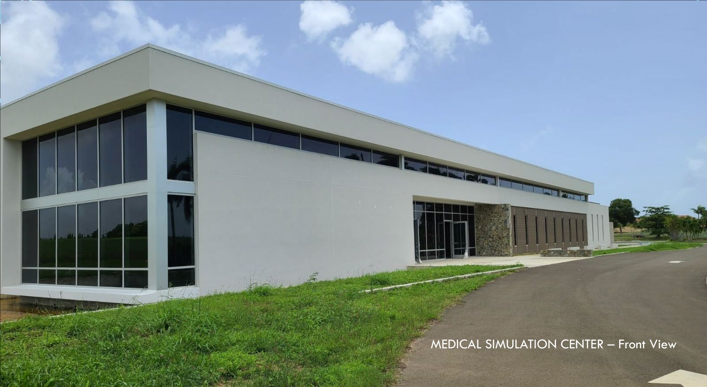
MEDICAL SIMULATION CENTER – Front View